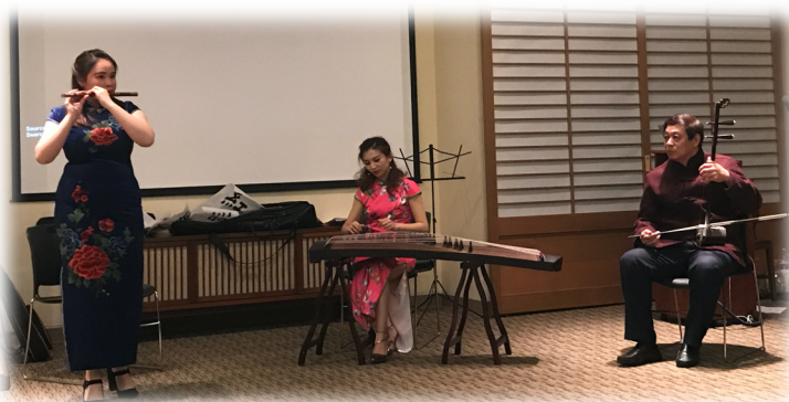
Chinese Traditional Music Ensemble