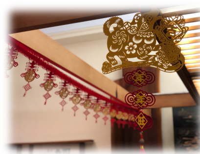
Lunar New Year Party