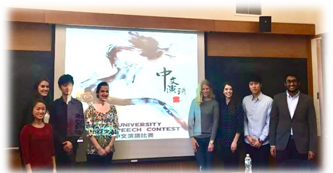
Chinese Speech Contest

For questions regarding the Chinese Language Program or Chinese language courses in general, please visit the website: http://ealac.columbia.edu/language-programs/Chinese/ Or contact Prof. Lening Liu at ll172@columbia.edu